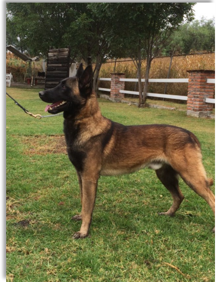
K9 Unit gets trained up before heading North!

This community initiated grant has seen a decline in alcohol-related calls and it hopes to further decrease calls within each community as they expand their efforts.