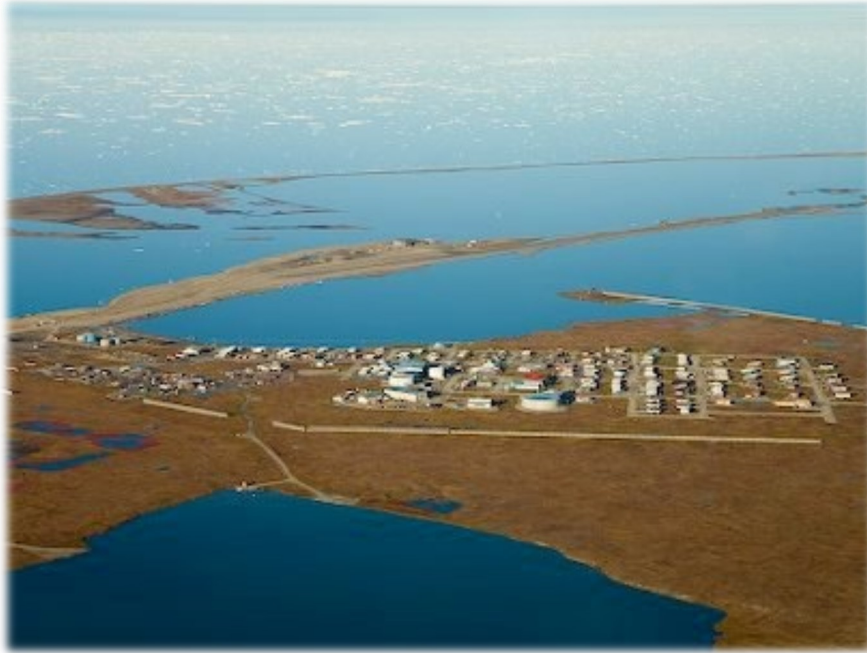
City of Kaktovik receives a new playground, thanks to our donors.